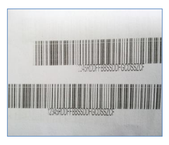
2. Missing when spray printing